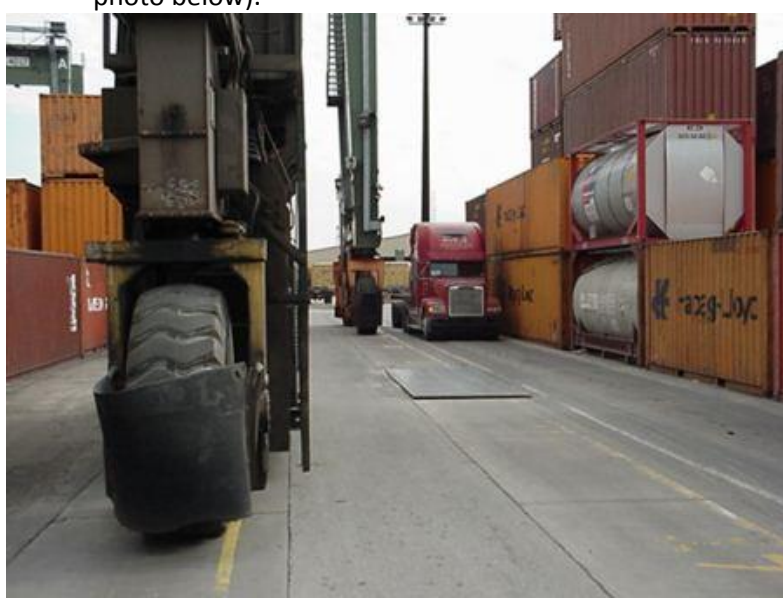
5.5.8. The RTG operator may sound a horn to assist a truck driver in correctly positioning the truck and chassis under the RTG. The horn is sounded once to signal the truck driver to pull forward. The