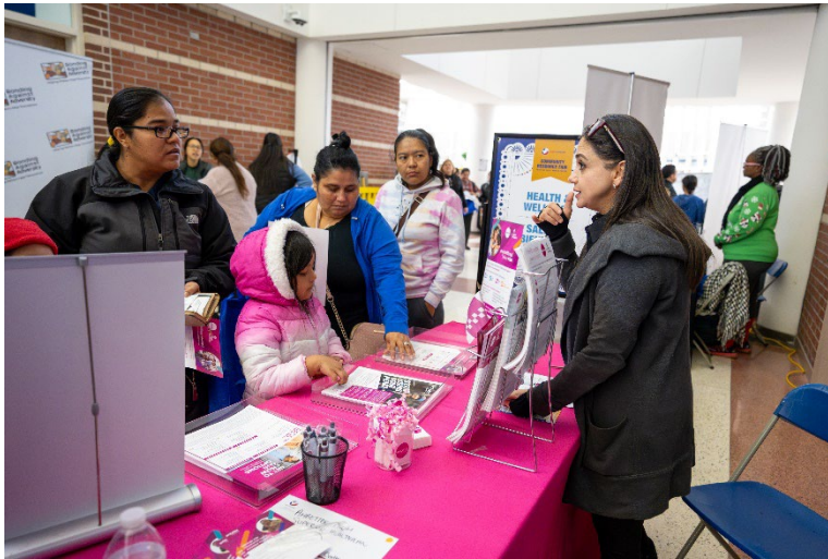
The third annual Community Resource Fair hosted by Port Houston on December 7 had approximately 3,000 attendees and nearly 60 partners providing services related to healthcare, workforce, and food distribution.