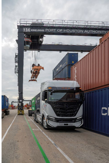
There is busy activity on the container yards at Port Houston terminals.