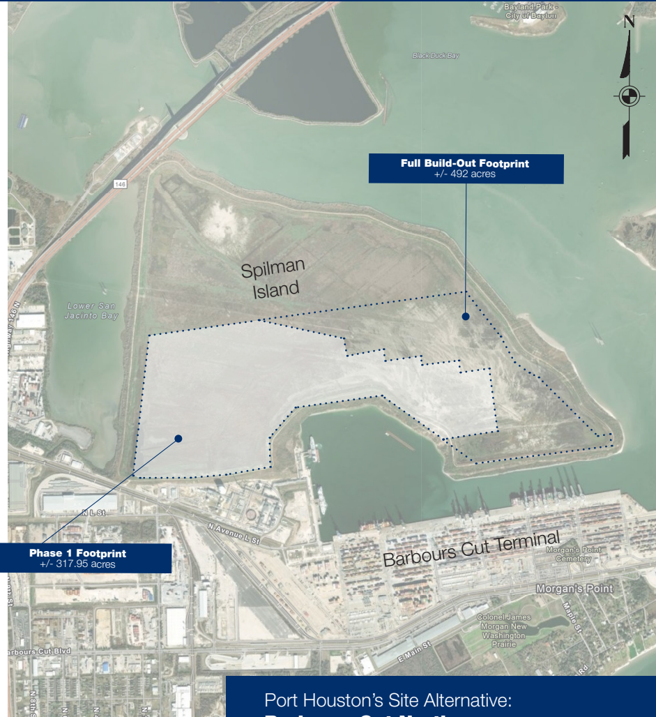
Port Houston's Site Alternative: Barbours Cut North

Current projections show the region will require additional container capacity within the next decade. We are taking steps to complete the first phase of the expansion to meet that demand, with subsequent phases progressing as needed.